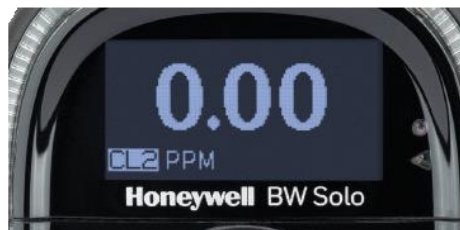
Easy to read