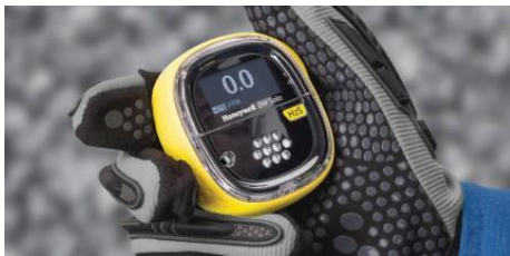
Easy to handle